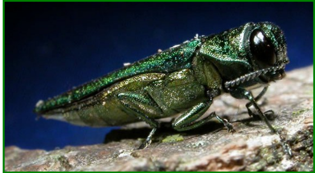
Figure 4. Emerald Ash borer

For more information go to the website: http://www.wvforestry.com or call the WV State Division of Forestry at: (304) 558-2788