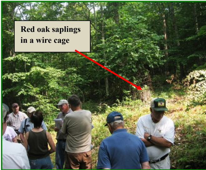
Red oak saplings in a wire cage