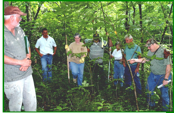
Figure 6. WOA workshops are a good way to meet others and learn ways to achieve your woodland management priorities.

As a member of the WV WOA do you know who the officers and regional board members are in your part of WV? Getting to know these folks (figure 5) and getting involved with them is a good way to create more educational opportunities and legislative support for properly managing your woodlands. Also getting more involved with them can help to increase the membership in the association, which gives the WOA more strength in gaining legislative support to assist you in more easily owning and managing your woodlands.